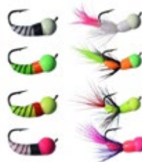
Standard ice flies for Yellow Perch.